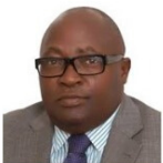
Olufemi Boyede @ExportDigestTV